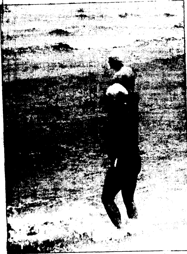
Swim team members enter the chilly Atlantic Ocean waters to begin their U.S. peace swim tour.

The three New Yorkers began their global series of peace swims